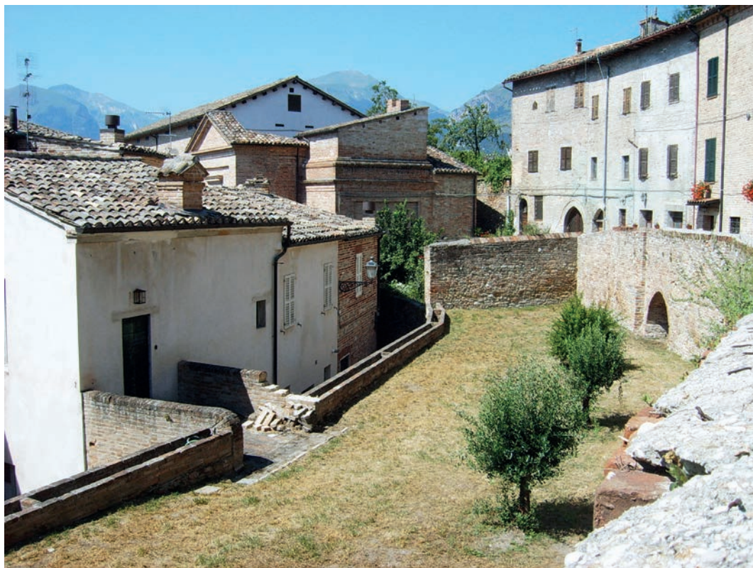
Fig. 1 – Terraced landscapes in the historical centre of Amandola (FM), Photo M. Ferretti, 2018.