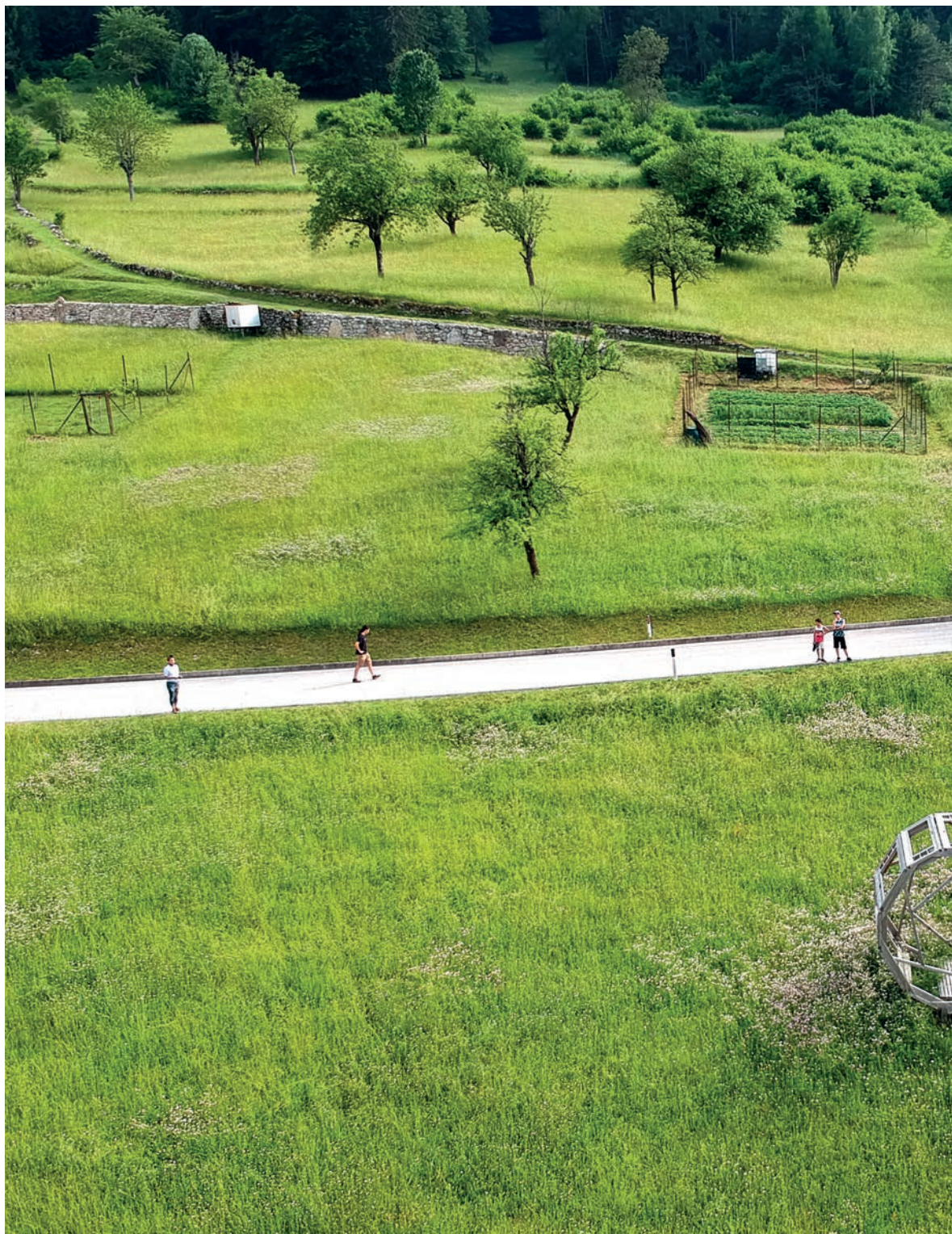
Fig. 5 – The wheel is thought of as an artistic installation but also as a lens to experiences through the landscape, Camposaz 2019.