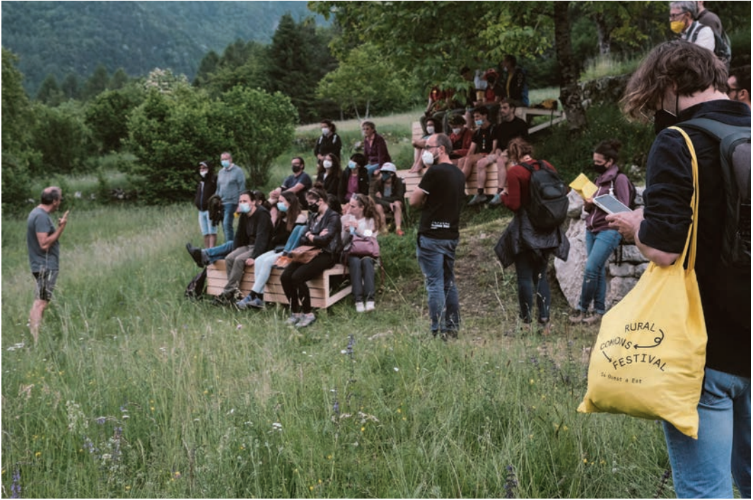
Fig. 6 – The Parliament of the Community by Camposaz in the terraced landscape of Geroli during the Rural Commons Festival.

novative regeneration, transformation, and adaptation strategies. The importance of considering the spatial resource in the definition of commons is quite evident, as space is where new actions can happen. At the same time, landscape design is also a crucial player not only for its inventive capacity, but also as it can direct the strategic and operative goals of these contexts. Therefore, there is even more need to find new ways of production of public space, prioritizing community-led initiatives to enhance immaterial values, traditions, and identities.