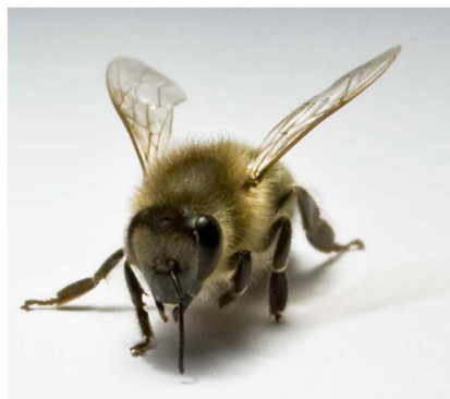
Figure 2 | A honeybee with its right antenna removed by section with microsurgical scissors.

lateralization was seen in the PER of dyads from different colonies but clear lateralization was present in C-responses. Unexpectedly, LA dyads of bees from different colonies performed fewer C-responses than RA dyads ( p = 0.053 ): the direction of the asymmetry was the opposite of that in same-colony dyads. From this finding we conclude that the right antenna controls social behaviour appropriate to context. Dyads using their LA do not adjust their agonistic behaviour (C-responses) according to the social context.