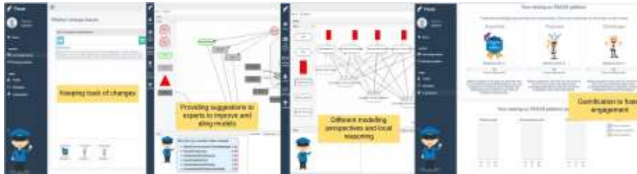
Fig. 4. 1 st release of the Pacas Platform

The idea, is that actors, directly involved in the decision processes, play a specific role in both the real life and in the platform, and make the infrastructure visible because, through the negotiation of interests, power and strategies, they use and at the same time may influence the inter-organizational culture and reveal the infrastructure underlying the entire ATM system. The actor engagement is carried out through gamification processes and gamified roles (such as the game master) in which users are involved [32]. In order to allow users to deal with their issues in a proper way, a modelling language based tool and a multi-view approach have been developed allowing each user to focus on her own individual perspective, without the need of a holistic representation, and to negotiate with the others what really matters and what really should be objectified. Conflicts are solved acting on procedures, unveiling connection between different views (through automatic reasoning), or asking the master in command to take a decision. The control of the process and the action taken in the platform push actors to get socially motivated and to take a decision in a reasonable period. The different roles planned in the platform enable users to handle events, change procedure and cross boundaries acting at different levels of decision processes.