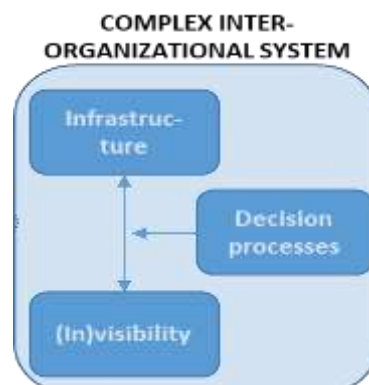
Fig. 1. The goal of the research

The goal of our work is to investigate how an inter-organizational and complex infrastructure is shaped and "cultivated", in particular when a change is planned and implemented in a complex inter-organizational system. In the interplay between infrastructure and its (in)visibility decision and negotiation have an important role and an impact on actors perception, organizational and inter-organizational culture, processes, technology, artefacts, etc. (Figure 1). These elements will be investigated in the following case study.