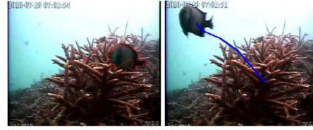
Figure 2: An example of fish detection and tracking

The workflow component has to dynamically generate the commands to invoke the fish detection and