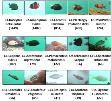
Figure 3: 15 most common fish species in the underwater camera footage

Fish species are organised in a hierarchical manner by biologists and we use a classifier with a similar structure. Forward feature selection is used to select a subset of all features, while support vector machines are used as the classifier at each node of the tree. At the moment, the fish recognition software is able to recognise the 15 fish species shown in Figure 3.