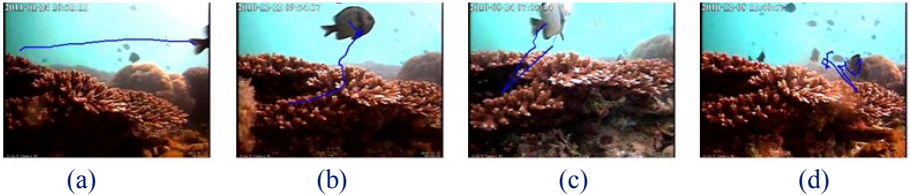
Figure 3: (a-b) Examples of normal fish trajectories, (c-d) Examples of abnormal (rare) fish trajectories.

abnormal (rare) behaviours are determined by visual inspection. The most usual and frequent behaviours in the dataset are freely swimming fish in open sea and hovering fish on the coral (Figure 3a-b) which represent normal behaviours. On the other hand, abnormal trajectories are: i) fish suddenly (in one frame) diving under the coral, ii) fish suddenly (in one frame) changing direction (predator avoidance, Figure 3c), iii) fish biting at coral (also interaction with plankton, Figure 3d), iv) diving quickly between the coral branches when frightened or to hide from predators, and v) aggressive fish which is moving fast. A trajectory that has normal and abnormal segments is assumed as abnormal.