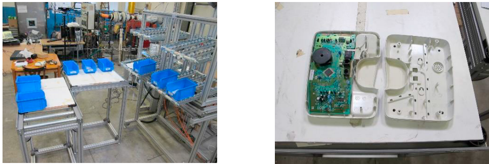
Fig. 3. Assembly station layout (left) and final product to assembly (right).