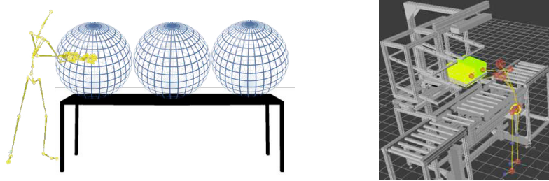
Fig. 1. Interaction between the operator hands and the CVs displaced on the workbench (left) and workstation shelves (right).

limbs is a valuable information if properly leveraged, in particular referring these measures to the workstation layout. The Control Volumes (CVs) concept is proposed for this purpose. A CV is a virtual object of any geometrical shape with defined dimensions and known 3D position within the monitored area. The CVs can be displaced on any relevant location of the productive environment, as on workbenches, inside boxes or around bins ensuring a remarkable flexibility. Checking if the 3D position of the operator body joints enters/exits to/from a particular CV enables to evaluate in real-time the interaction between the worker and his productive environment (Fig. 1). Finally, a visual feedback is provided to the worker through a monitor representing a powerful AR solution superimposing on the RGB live video the mannequin of the operator digitalization and its interaction with the virtual CVs displaced around physical objects validating right activities and highlighting wrong actions (see Section 5).