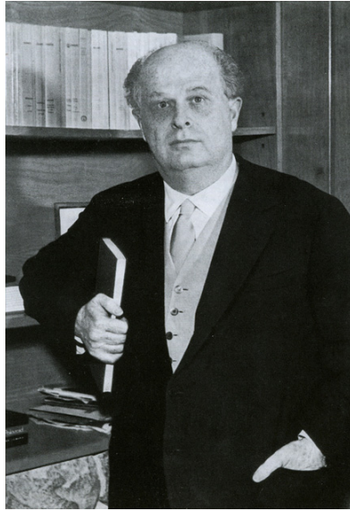
Figure 1 – Adriano Olivetti (Source: Urbanistica , 30, 1990).

A general picture of town planning in Italy must be seen in the particular atmosphere which has developed since the war; and must be introduced by a reference, however brief, to town planning activity as it was carried out in this country during the decade preceding the war. Without this, the foreign observer, examining aspects of present activity, might either form too optimistic an opinion by considering isolated achievements, or a pessimistic one by judging only from the official results of plans. In either case he would lose sight of the significance of the slow and difficult process which was clarifying and transforming town planning in Italy; and for the foreign observer, who is in a position to make comparisons with other countries, this is certainly its most interesting and striking aspect. With Olivetti passing away, however, Italian planning lost any form of appeal to the eyes of non-Italian planning scholars. The figure of Olivetti was important in the international context, and perhaps even more so than in Italy. In announcing his death, the editorial in the Town Planning Review , written by Paolo Radogna, a student of the Department of Civic Design, underlines the sense of Olivetti's message and his role within Italian planning: