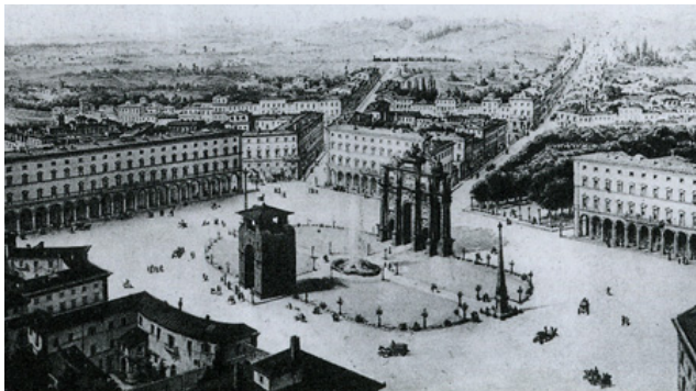
Figure 2 – Project for Piazza della Libertá, Florence.

proper structure for planning controls and peripheral offices of the Ministry itself were able to provide reasonable support to the implementation of the Town Planning Act of 1942. Also, Planning education had started, with postgraduate courses not too dissimilar to planning courses in the economically most advanced countries in Europe. The recognition of INU could be the first step for establishing a planning profession in the same way as the British Town Planning Institute. Planning experience in Italy was not negligible. From 1865, with the Town Plan for Florence (Figure 2), up to the most recent "Piano Regolatore" for Milan and for Rome in 1928 and 1932, there existed a solid base for a more generalised approach. Also the new towns, created by the Fascist Regime (Figure 3), were important pioneering experiences at that time, even though their impact was vitiated by their reactionary ideological content.