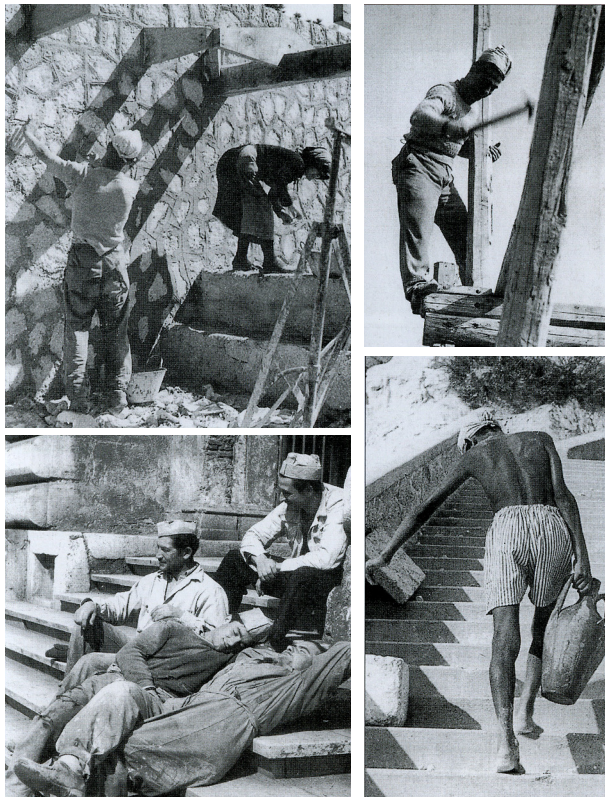
Figure 5 – Low-tech building sector: Engine of economic growth (Source: Camerini et al, 2000).

could induce development in many sectors of industry (Figure 5). All this was supported by huge housing deficit. On the other hand the demand was inflated by industrial development itself, attracting more and more manpower from the country into industrialised metropolitan areas. Bardazzi (1984) has shown the close correlation between post-war planning legislation and the trends of the building industry. The conclusion is that the real aim of planning legislation was to support the building industry more than setting up an efficient planning system.