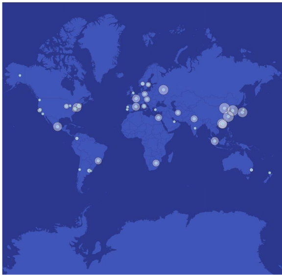
Fig. 2 Map of active MetaSUB sites. We have shown all the sites of the MetaSUB International Consortium that are collecting. The sizes of the circles are proportional to the number of riders per year on the subway or mass-transit system

metagenomics ( www.pathomap.org/map ) [1]. In addition to visualizing scientific data, we will use visual representations to aid in the coordination and organization of the consortium, e.g., metadata regarding the number of samples collected and processed in each site. Finally, the kind of data will dictate the design of the visualizations. Such data include metadata taxa present (phylogenetic relationships and abundance), metabolic pathways, functional annotations, geospatial relationships, and time-lapse data. Finally, metadata outlined in Table 1 will also be integrated into the design of these visuals, since the metadata from a study can readily become the raw data for a follow-up study.