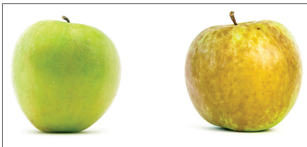
Figure 1. Fruit of ‘Granny Smith’ apple cultivar asymptomatic (left panel) and showing superficial scald symptoms (right panel).