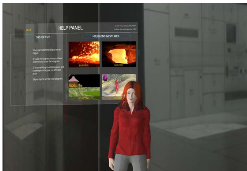
Figure 2: the virtual assistant explaining the use of the help panel.

Each of the areas defined above is fully featured with an help panel, working interfaces for navigation and interaction with the already existing holograms.