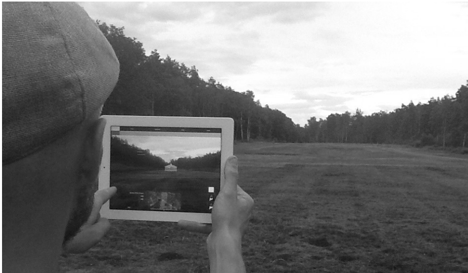
Figure 11.2: CEEDs 'history' application (retrieved with permission from "Spatializing experience: a framework for the geolocalization, visualization and exploration of historical data using VR/AR technologies" by Pacheco et al., 2014)