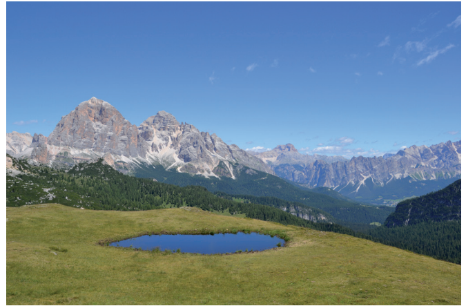
Fig. 4 - Costone del Col Piombin. One of the terraces on which Sauveterrian lithic artefacts have been collected. / Costone del Col Piombin. Uno dei terrazzi su cui sono stati raccolti i manufatti sauveterriani.