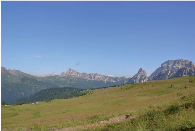
Fig. 2 - Melei. Numerous sites have been identified mostly along the modern path. / Melei. Lungo la cresta numerosi siti sono stati individuati per lo più in corrispondenza del sentiero.