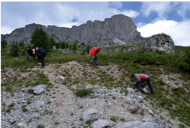
Fig. 3 - Piezza. The Sauveterrian site has been partially destroyed by mechanical excavations. / Piezza. Il sito è stato in parte distrutto dai lavori di scavo.