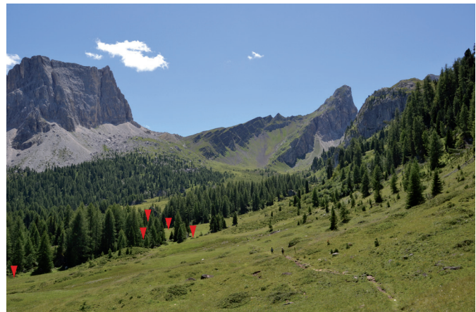
Fig. 5 - Prà Comun - Val Costeana. Numerous Castelnovian sites have been identified along this secondary valley, located at the foot of the Col Piombin. / Prà Comun - Val Costeana. Lungo questa valle secondaria, posta ai piedi del Col Piombin, sono stati identificati numerosi siti castelnoviani.

The eastern slope of Passo Giau features one of the richest areas for Mesolithic findings. Five sites were identified on the five terraces that characterise the northern ridge of Col Piombin (Fig. 4). All of them yielded Sauveterrian lithic assemblages. Only one trapeze was collected at site 4, representing the only artefact dated to the Late Mesolithic coming from this area. On the other hand five of the seven sites located on the valley at the foot of the Col Piombin - known as Prà Comun-Val Costeana - are undoubtedly Castelnovian (Fig. 5).