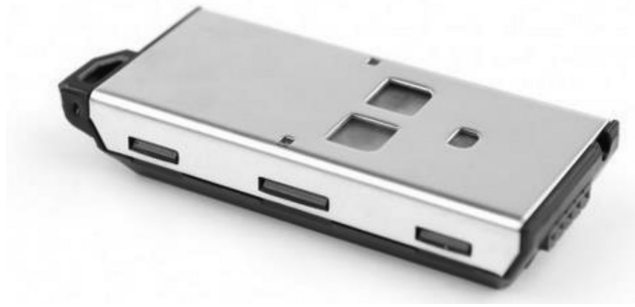
Figure 1: Portable multi-sensor Sensordrone™.

Eighty portable multi-sensor Sensordrone™ (Fig. 1) were distributed among the population of Trento (Italy). This detector was produced from Sensorcon, an American company with over ten years of experience in the design, production and integration of environmental sensors. Such tool, inter - connectable with smartphones through special applications, is equipped with various types of sensors such as precision gases, oxidizing gases, reducing gases, temperature, humidity, pressure, infrared temperature, capacitive proximity, intensity of colour (red, green and blue) and brightness. Sensordrone™'s dimensions are 6.78 \times 2.80 \times 1.24 \text{ cm}^3 .