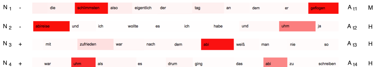
Figure 3: Distribution of attention weights (darker shade of red = higher weight) on four (fragments of) consecutive narratives ( N ), two negative (-) and two positive (+) by the same individual, in the sequence tagging architecture. The gold valence scores at each timestep of self-reported affect ( A ) were first medium and then high (M,H,H,H). All scores were correctly predicted by the model.

tant information for the current valence prediction, in the next experiment, we use the ‘prev_val’ feature as described in Section 3.1. Since subjects reported valence using a 10-point Likert scale, and these values were not subject-normalized, different people might interpret the scale differently. This experiment is thus aimed at verifying whether the contextual information about previous states-of-mind of the same user could be helpful in predicting the current one. With this additional feature, we get an accuracy score of 66.3%, almost 9% increment from the baseline. This result shows that the context is indeed an important factor for current state-of-mind and previous valence state captures this context precisely. This provides motivation to perform experiments trying to capture context information from the text.