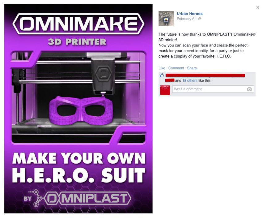
Fig. 1: A picture posted on the #UH Facebook page, with the accompanying caption. Manuel Strali.

(The Urban Heroes team does not answer for possible violent acts / robberies / murders committed while wearing the customized masks) (6 February 2015, 3:18 PM—translated from Italian)