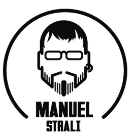
Fig. 3: Logo-portrait of Tin Hat members. Manuel Strali.

can sympathize. The fact that people's everyday life is displayed more and more in its mundane details, 'confessed' (Foucault 1980) and staged at the same time, and made the spectacle itself - 'reality emerges from the spectacle, and the spectacle is real', as Debord maintained (Thesis 8) - has been a very important success condition of the crowdfunding campaign and the social media one alike.