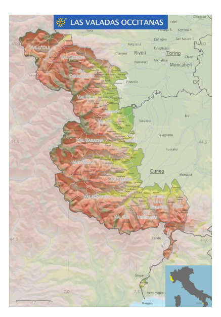
Figure 1 – Map of the Occitan valleys on Italian territory. Archive of the Chambra d'Òc cultural association at <a href="http://www.chambradoc.it/valadasOccitanas.page">http://www.chambradoc.it/valadasOccitanas.page</a>.