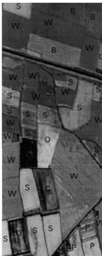
Figure 2. Extract of the ATM data, in 0.60–0.63 \mu\text{m} waveband, with class type annotated.

To simplify the analyses and aid the acquisition of sufficient training data, only the data acquired in three wavebands, those located at 0.60–0.63, 0.69–0.75, and 1.55–1.75 \mu\text{m} , which had been identified in earlier studies (e.g., [38]) as providing a high degree of class separability, were used. Here, attention focused on the six crop classes that dominated the region at the time of the ATM data acquisition: sugar beet (S), wheat (W), barley (B), carrot (C), potato (P), and grass (G). Following the widely used 30p heuristic, where p is the number of discriminating variables that is often used with statistical classifiers [39], a training set comprising at least 90 cases for each class was required. Here, a total of 100 pixels of each class were randomly obtained from the ATM data and used to form a training set ( n = 600 ). This initial training set is balanced, with each class equally represented, and was taken to be perfect or error-free. The location of the six classes in the three waveband feature space is shown for these training data in Figure 3.