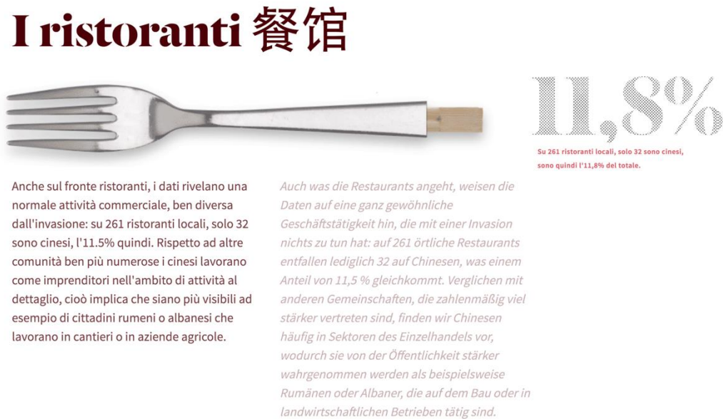
Figure 3. Animated data visualisation that shows the percentage of Chinese run restaurants in Bolzano.