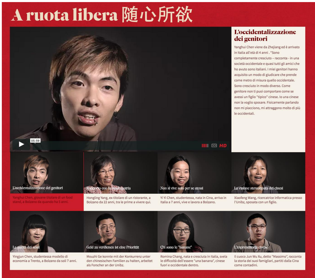
Figure 4. The eight interview to the member of the Chinese community of Bolzano.

His interview helped to explain why Chinese often live in their shops and have a different idea of social life, compared to the western model.