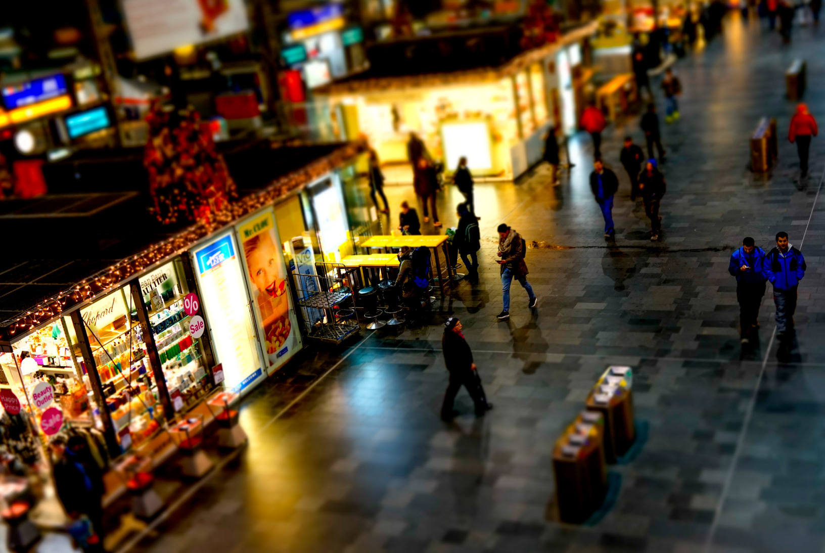
Frankfurt Main Station, November 2015.

low-skilled service jobs (e.g., personal and health care, retail, hotel and restaurants, security) have steadily increased in the advanced economies. These low-skilled jobs cannot be eliminated by existing technologies and reflect the growing share of services in total domestic