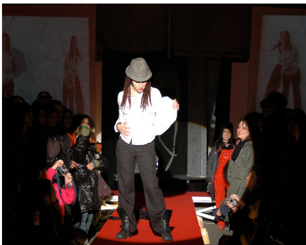
Picture 6: Pregnant lady: A baby is more fashionable than a fox terrier!

http://serpica.tumblr.com/post/2983022084/pregnant-lady-2005-a-baby-is-more-fashionable