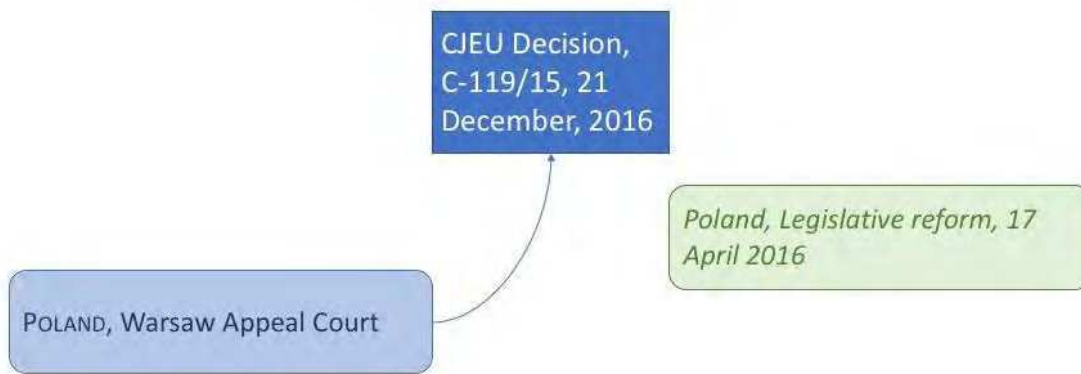
Fig. 3.1, Biuro