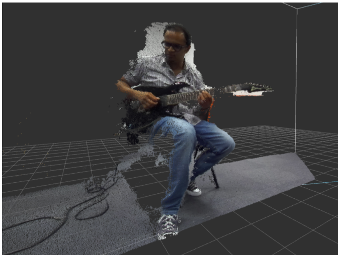
Figure 3: Example of a point cloud captured by the ZED camera during a live performance

extended to four participants without loss of generality (currently Elk LIVE supports the interconnection of four musicians).