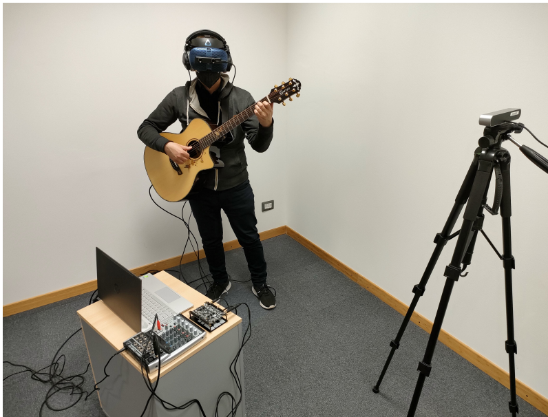
Figure 1: A picture taken during the testing phases of the proposed networked musical XR solution. The participant, while playing the instrument is able to visualize the virtual scene with the other musicians. As it can be seen the whole architecture consists of off-the-shelf hardware, that can be easily configured to suit the application scenario.