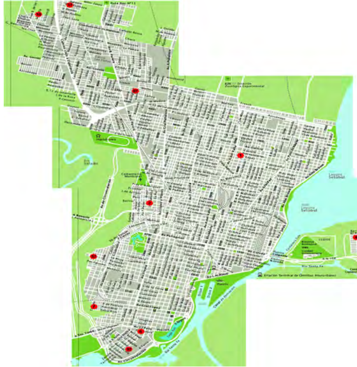
Fig. 3. City of Santa Fe. Red bullets indicate the location of the Centers for Family Action (CAFs) operative in the city. Note that the majority of them are positioned on the outskirts of the city where the poorest areas can be found [45].