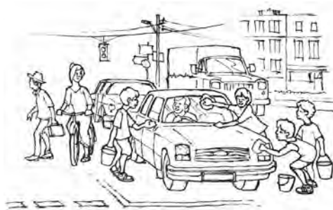
Fig. 1. A representation of a common panorama seen in many big cities, particularly in underdeveloped countries, where street children clean the windshield of a car at the stoplight. Reproduced from [9].

Street children are not only concern of underdeveloped areas because in practice every city in the world has some street children, including the biggest and richest