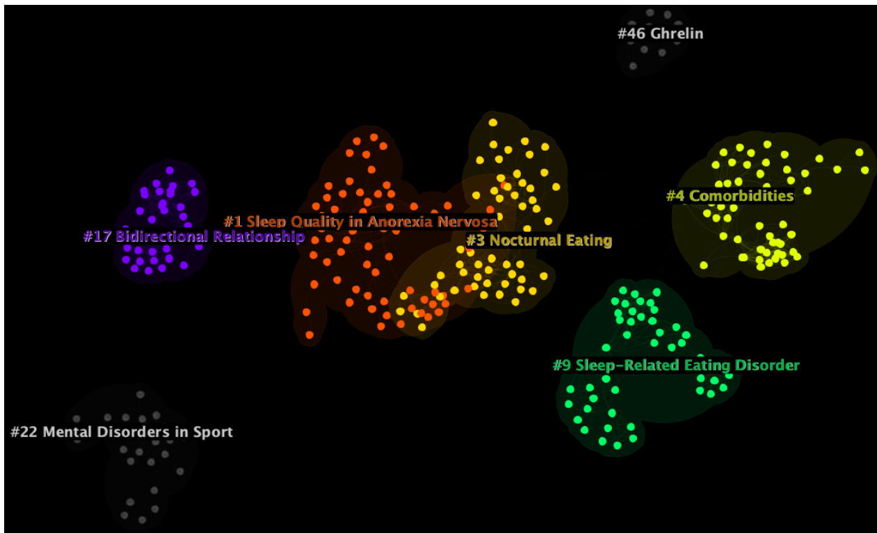
Figure 3. Document co-citation analysis network of all studies on sleep in eating disorders. Seven major clusters were identified. The image was generated with CiteSpace software [24].

Seven major thematic clusters were identified in the network. The three largest clusters were cluster #1 (size = 69; silhouette = 0.956; mean publication year = 2014), cluster #3 (size = 57; silhouette = 0.970, mean publication year = 2007), and cluster #4 (size = 56, silhouette = 0.973, mean publication year = 2010). Based on their silhouette scores, the most homogenous clusters were cluster #17 (size = 34; silhouette = 1.000; mean publication year = 2015), cluster #46 (size = 11; silhouette = 0.999; mean publication year = 2010), and cluster #22 (size = 25, silhouette = 0.995, mean publication year = 2013). Moreover, cluster #17 was also the most recent cluster in the network, followed by cluster #1 and cluster #22. Finally, the three earliest clusters were cluster #9 (size = 48; silhouette = 0.991; mean publication year = 2005), cluster #3, and cluster #46. All clusters were initially automatically labelled using CiteSpace's log-likelihood ratio (LLR) algorithm. LLR was chosen because it provides the most accurate labels compared to other automated methods. However, LLR in some cases might lack accuracy as compared to manual labelling [16]. Therefore, a qualitative inspection of clusters was conducted by the authors and an alternative label was suggested when appropriate [42]. More detailed information on all seven major clusters can be found in Table 1.