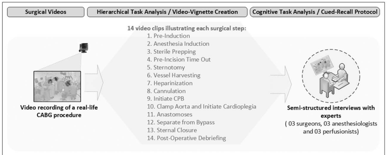
FIGURE 1. Methodological approach.