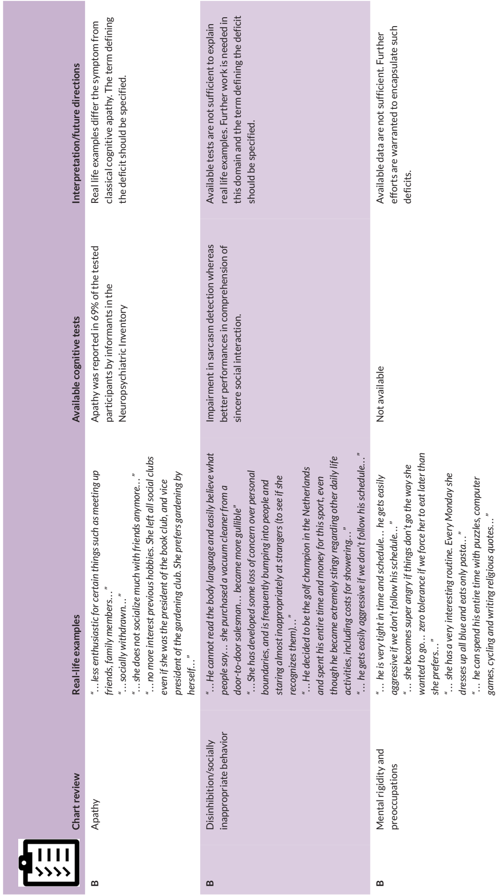
TABLE 4 (Continued)

Note: B: Symptom can be reported as a behavioral problem by the caregiver. L: Symptom can be reported as a language problem by the caregiver. M: Symptom can be reported as a memory problem by the caregiver.