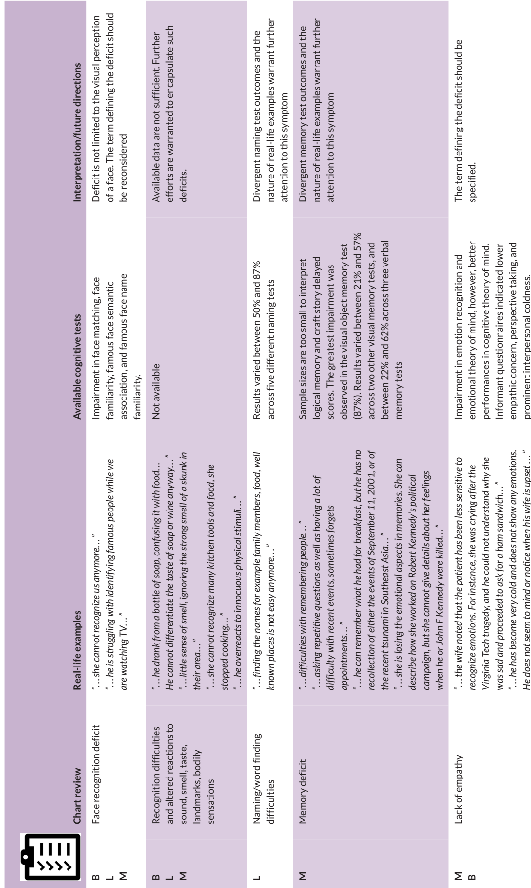
TABLE 4 Summary of the overall results and interpretation