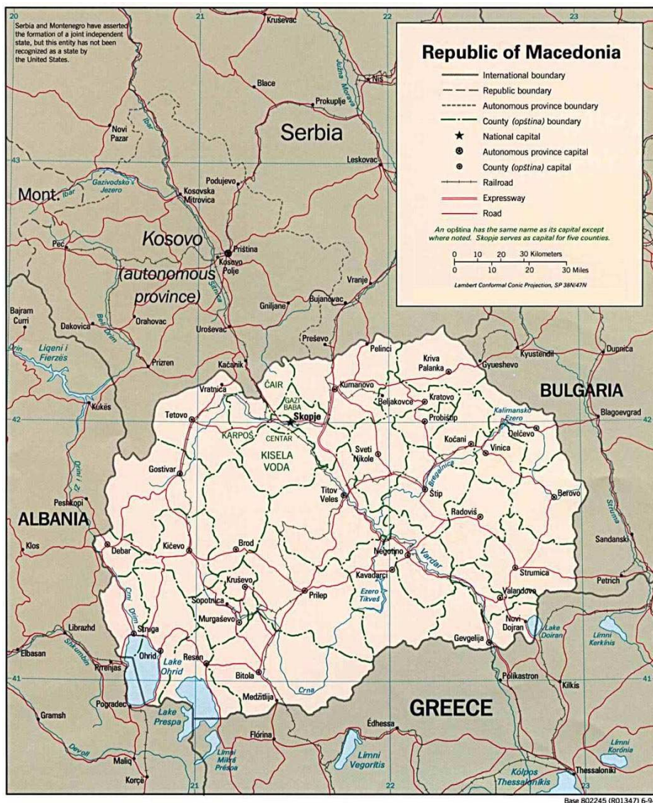
Map of Macedonia

by playing the role of policy entrepreneur. The third section analyses how the crisis was perceived within the EU. This section argues that, following the lesson learned in the conflicts of Bosnia and Kosovo, EU leaders developed a shared perception of the threat coming from Macedonia. The latter, in particular, was depicted as a common threat to EU values and credibility, and as an event for which the EU had a responsibility to act.