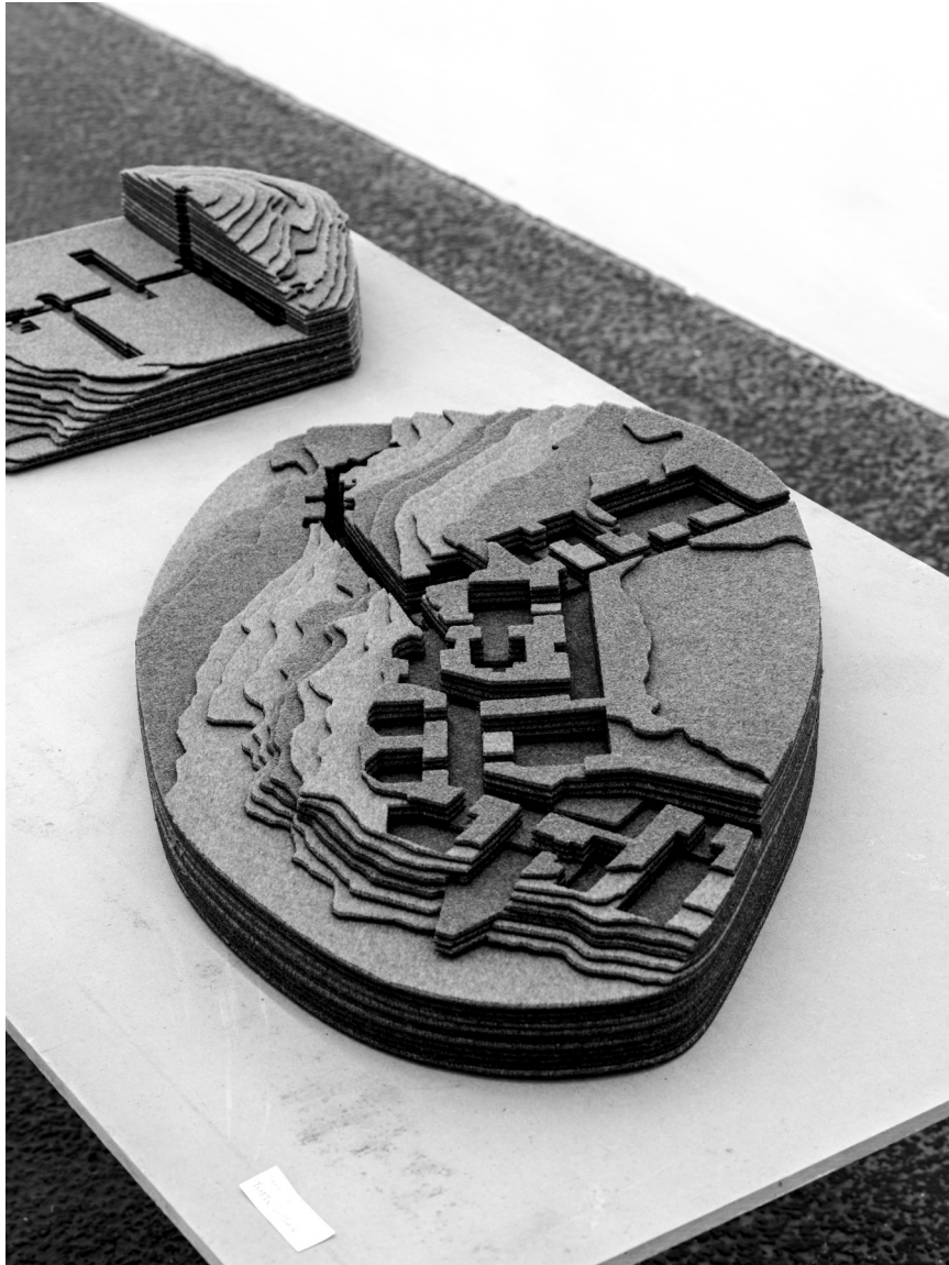
Fig 02 Maquet in felt inspired to Forte Valmorbia (TN) from the maquette series Soft Landscapes realized for the exhibition “Paesaggi Forti” by Cristina Gallizioli. Photo by Riccardo De Vecchi, 2022.