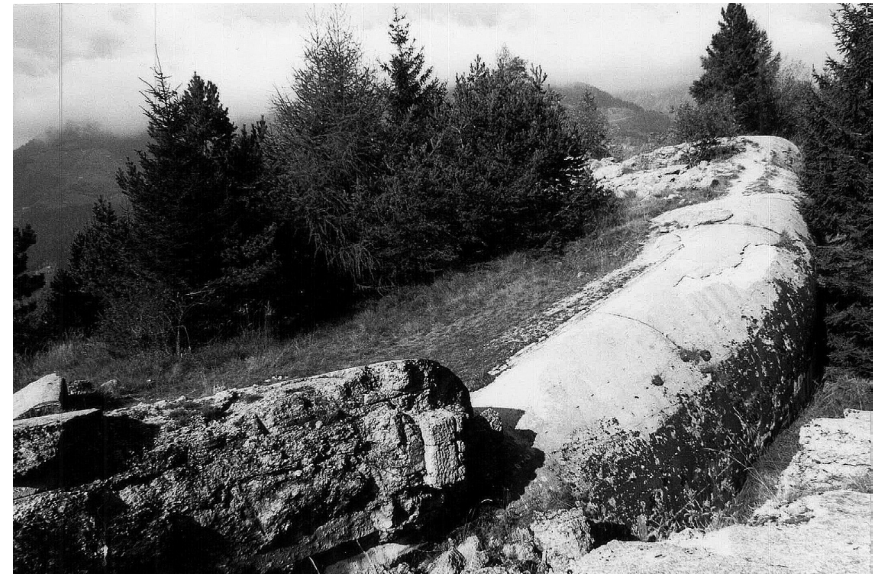
Fig 03 Forte Carriola from Gian Piero Sciocchetti archive, Università di Trento. Photo by Gian Piero Sciocchetti, 1980s