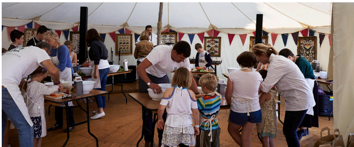
Fig. 2. A visual represents the intergenerational interaction of the Abergavenny Food Festival website.