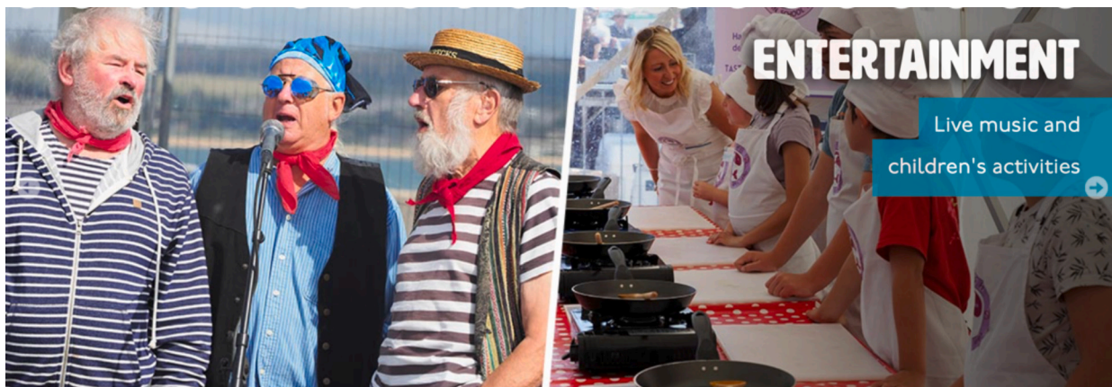
Fig. 3. The top section of the Dorset Seafood Festival website.

The ideology of a healthy diet and slow food actions are part of most food festival discourses (Frost & Laing, 2013; Pizzichini et al., 2021). A plant-based diet is presented as a health-conscious choice on the Ludlow Food Festival website, while seafood – with sustainable fishing practices – is endorsed by the Dorset Seafood Festival and the Galway International Oyster and Seafood Festival. A healthy diet is associated with cooking skills, as shown by the festivals' visual discourse. Festivals actively involve children, teens, and young adults in the preparation of dishes with vegetables. Not only families but also children are in charge of their own health, as the following quotation from the Dorset Festival website shows: