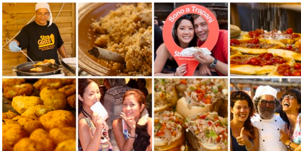
Fig. 4. Collage displaying traditional food on the Stragusto Festival website.

This event highlights the traditions of crafting and savouring the renowned Danish (Scandinavian) sandwich, Smørrebrød , within the context of gastronomic heritage. The event's description underscores that in the 1800s, urbanization led to a transformation of daily meals, with workers shifting from cooked midday meals on farms to cold rye-bread-based options. The food's origin, rooted in the working class, is portrayed in an accompanying drawing. While the narrative visual recalls a humble way of life, it is juxtaposed with the current understanding of the sandwich as something particular. The cultural and historical references are part of the symbolic capital of local communities and the act of remembering the humble origins of the Smørrebrød