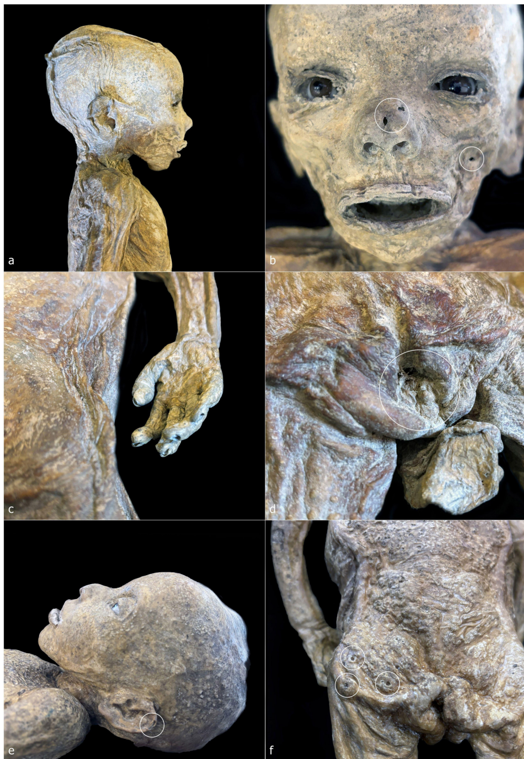
FIGURE 4 ID2—detailed photographs: right lateral view of the head and chest (a); frontal view of the face (b); detail of the skin on the right flank and right hand (c); detail of the perineal area (d). ID3—detailed photographs: left lateral view of the head (e); posterior view of the gluteal region (f).

mouth open, the nose flattened relative to its natural anatomy, and the eyelids arranged to reveal partially open eyes (Figure 3b).