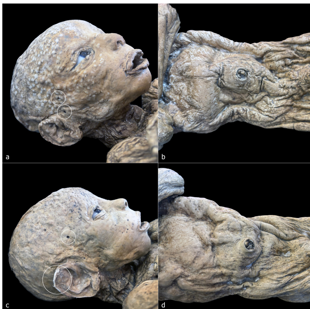
FIGURE 5 ID4—detailed photographs: right lateral view of the head (a); anterior view of the torso (b). ID5—detailed photographs: right lateral view of the head (c); anterior view of the torso (d).

certain elements appear highly radiodense (Figure 8aI), and the face, where nasal soft tissues are appreciable (Figure 8bI). As observed in the other specimens, two radiodense ovoid elements are visible within the orbital cavities (Figure 8bII), and increased radiodensity is present in the nuchal region of the neurocranium (Figure 8bIII). The sternal ends of the ribs appear slightly expanded (Figure 7aII), while the distal articulations of the radii and femora near the metaphysis show irregular margins and non-homogeneous density (Figures 8aIII,cI). The distal epiphyses of the tibiae and fibulae have slightly expanded margins, which cause them to appear flattened (Figure 8cII).