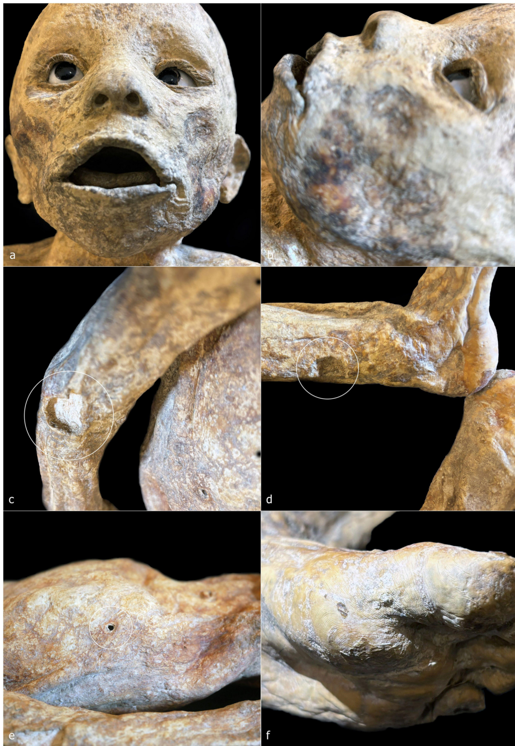
FIGURE 6 ID6—detailed photographs: frontal view of the face (a); left lateral view of the face (b); detail of the right arm and forearm (c); detail of the left leg and ankle (d); right lateral view of the trunk (e); plantar surface of the left foot (f).