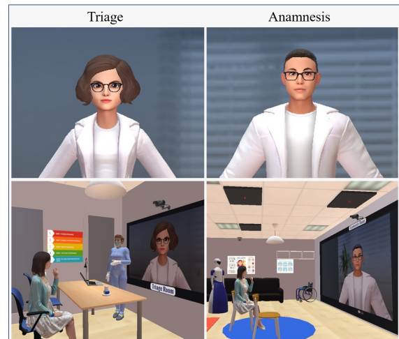
Figure 2: The figure shows avatars on the top and virtual rooms at the bottom of the triage and anamnesis rooms.