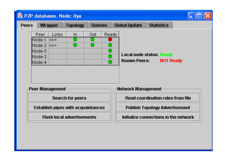
Figure 3: Peer discovery window

ery algorithm. When a node starts, it creates pipes with those nodes, w.r.t. which it has coordination rules, or which have coordination rules w.r.t. the given node. Several coordination rules w.r.t. a given node can use one pipe to send requests and data. If some coordination rules are dropped and a pipe is not assigned any coordination rule, then this pipe is also closed.