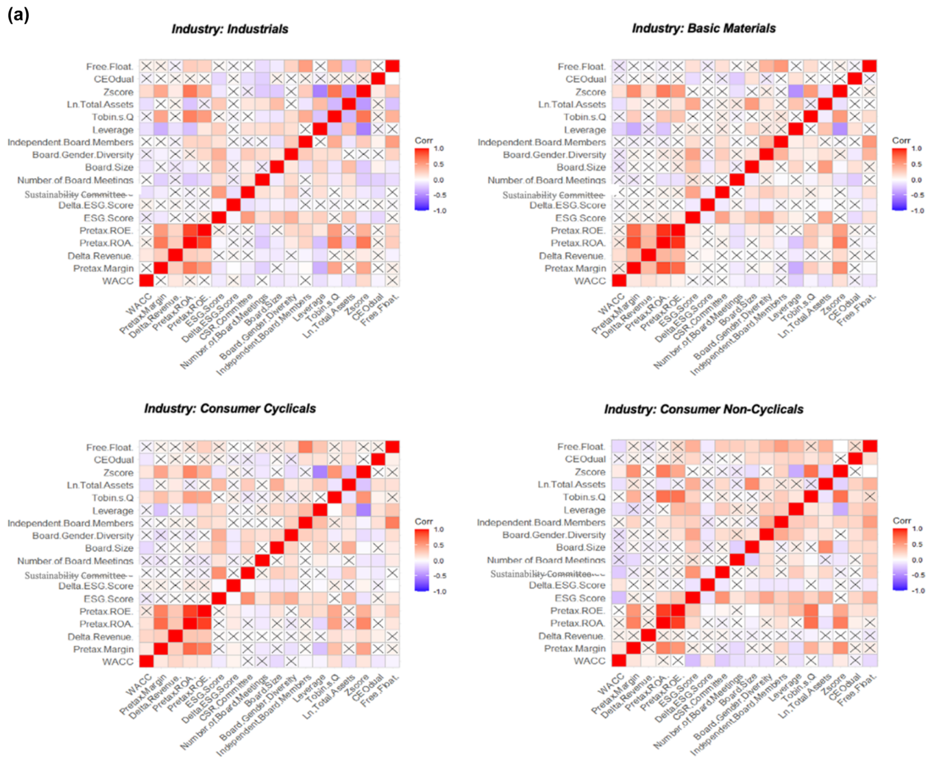
FIGURE 1 A. Spearman's correlation matrices (industrial, basic Materials, consumer cyclicals, consumer non-cyclicals). B. Spearman's correlation matrices (energy, technology, real estate, financials, healthcare, utilities).

Pre-tax Margin is highest in Real Estate (44%) and lowest in Energy (−10%), while Pre-tax ROE is negative in Energy (−1%) and highest in Consumer Non-Cyclicals (23%). Pre-tax ROA shows the least variation, ranging from 0% in Energy to 9% in Healthcare.