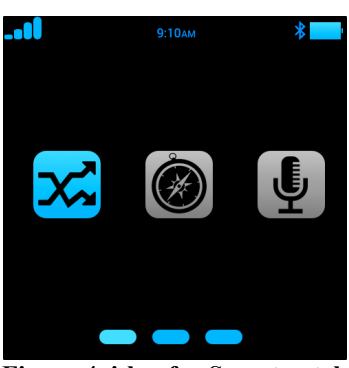
Figure 4. i-log for Smartwatch